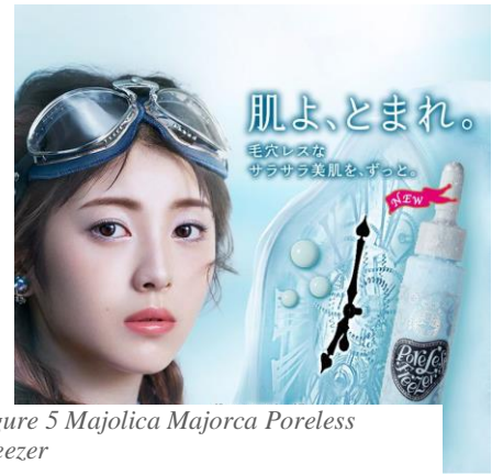
Figure 5 Majolica Majorca Poreless Freezer

To avoid make-up transfer on the mask and to generally get a good fixing against any smudging, caking or drying, locking the make-up is a key gesture, with brands going even further by bringing benefits such as cooling, pore-tightening, hydrating and bringing glow.