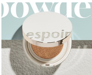
Figure 2 ESPOIR PRO TAILER BE POWDER CUSHION SPF 42 PA++

hybrid solutions such as tone-up base and tinted moisturizers.