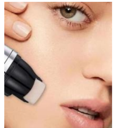
Figure 12 REC SPACER ROLLING BB CUSHION FOUNDATION

creasing or caking or look cakey even after a long time wearing.