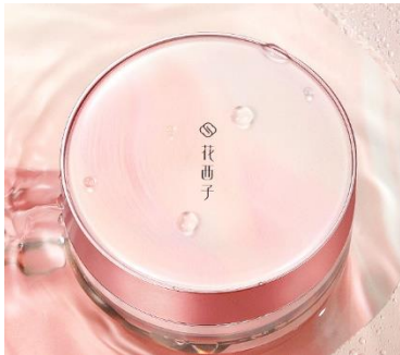
Figure 6 Florasis Icy Peach Powder

Cooling appears as a major benefit with primers ( MAJOLICA MAJORCA PORELESS FREEZER ), fixing mists ( SHUSHUPA! MAKE KEEP SPRAY COOL PLUS ) and even setting powders ( FLORASIS ICY PEACH POWDER ) that keep the skin fresh and soothed, while insuring a perfect finish and long-lasting performance.