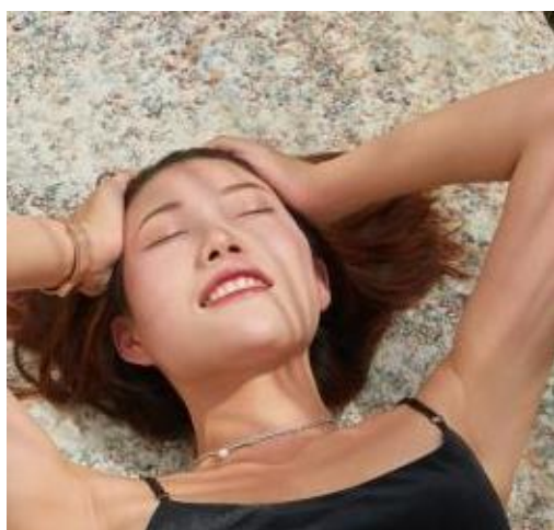
Figure 4 Micro-light skin

In 2020, Creamy Skin (奶油肌) was one of the most desired finishes, especially for Chinese consumers, as it is the “ happy medium finish between water glowy skin and velvet matte skin ”.