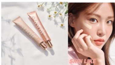
Figure 8 ESPOIR SKIN LIKE TINTED MOISTURIZER SPF50+ PA+++

Hybridization of skincare and make-up has evolved to meet new concerns generated by Covid-19 : beautiful skin finish without heavy make-up, new skin sensitivity/problems due to mask wearing, as well as a renewed fear of external aggressions like UV, pollen or pollution.