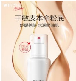
Figure 10 WINONA SAFE SOOTHING & MOISTURIZING SERUM FOUNDATION

A combination of UV base and face power provide minimum coverage and maximum protection during the day. ALLIE COLOR TUNING UV SPF50+/PA++++ is a “No Foundation UV” that makes the skin look more beautiful with its color-correcting effect even when you don’t wear a foundation