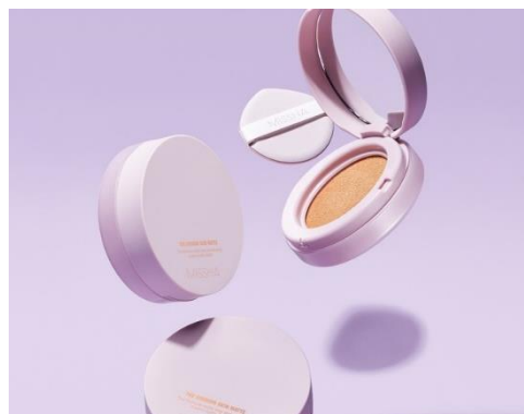
Figure 3 Misha Cushion Skin Matte

proof cushion with a Slurry Cushion™ Technology that stabilizes high amount of powder base. The powder covers pores and blemishes while oil prevents dryness.