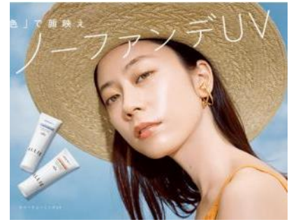
Figure 9 ALLIE COLOR TUNING UV SPF50+/PA++++

Espoir has launched SKIN LIKE TINTED MOISTURIZER SPF50+ PA+++ , an all-in-one base working as a second skin that enlivens skin tone and instantly delivers much-needed moisture and comfortable coverage with a smooth finish for a perfect bare-skin look. A wide variety of UV base with a color-correcting effect has been released this year.